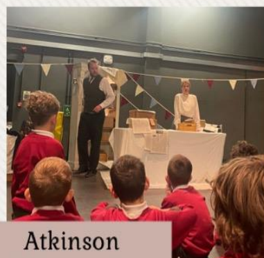
Atkinson Museum's Performance

The Atkinson hosted a special performance to help us learn more about Victorian Southport.