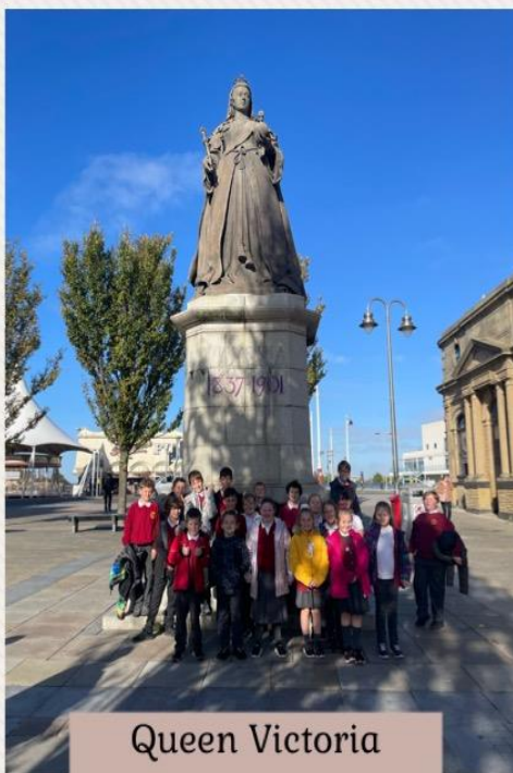
Queen Victoria statue